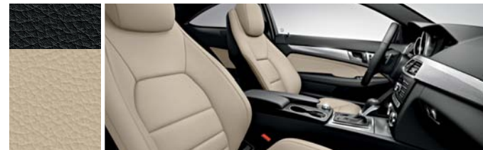
Sahara Beige/Black (requires leather upholstery)