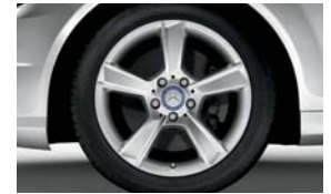
Standard 17" 5-spoke (C 250)