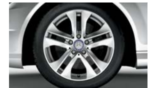
Standard 17" split 5-spoke (C 250 and C 300 4MATIC Luxury)