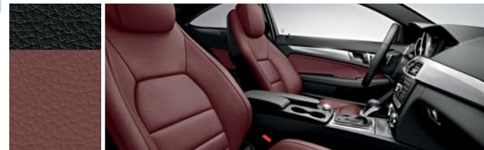
Red/Black (requires leather upholstery)