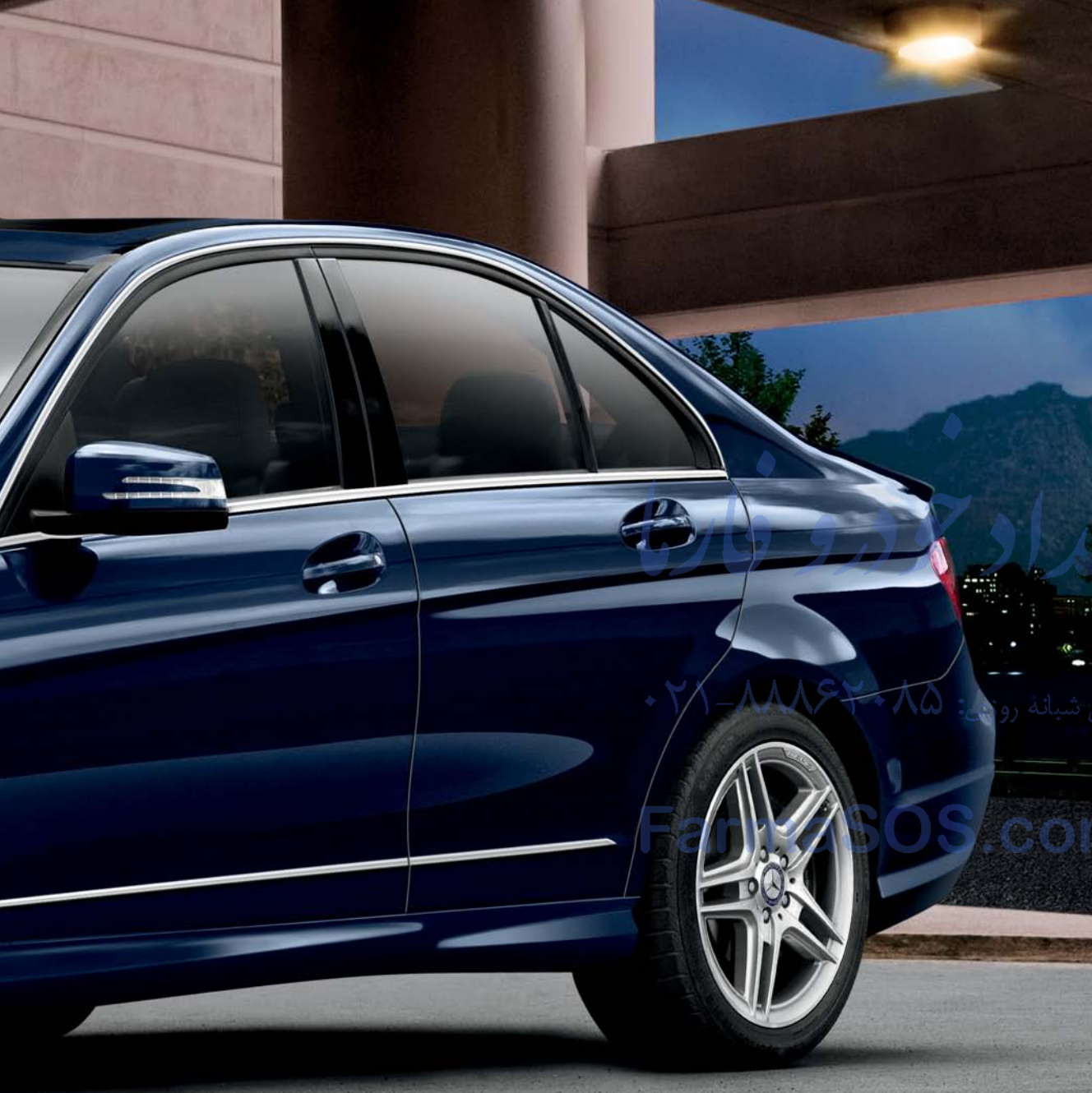
C350 Sport Sedan shown above with optional Lunar Blue metallic paint, 18" AMG twin 5-spoke wheels, and Lighting and Premium 1 Packages. C300 4MATIC Luxury Sedan shown at right with Black paint and optional Lighting Package. Please see endnotes at back of brochure.