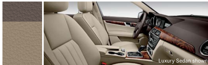
Almond Beige/Mocha (not available with leather upholstery on Sport Sedans)