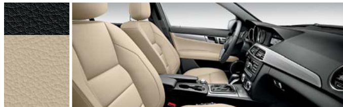
Sahara Beige/Black (Sport Sedans only, requires leather upholstery)