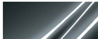
Steel Grey (Coupes)