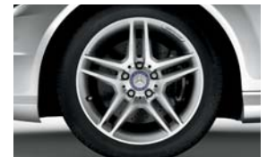
Standard 17" AMG twin 5-spoke (C 350)