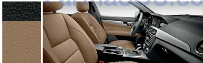
Cappuccino/Black (Sport Sedans only, requires leather upholstery)