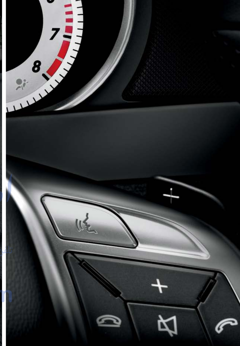
C250 Coupe shown with Red/Black interior, Aluminum trim, and optional Full Leather Seating and Premium 1 Packages. Please see endnotes at back of brochure.

Revs within reach. The sporty 7-speed automatic transmission has been reengineered for quicker shifts and more efficient performance. Standard paddle shifters let you change gears without taking a hand from the 3-spoke steering wheel. Multifunction controls allow equally easy access to the hands-free Bluetooth® interface and audio system.