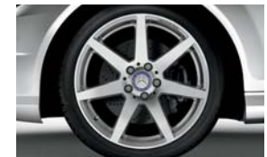
Optional 18" AMG 7-spoke (Sport Sedans)