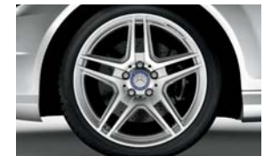
Optional 18" AMG twin 5-spoke (Sport Sedans)