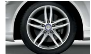
Standard 17" twin 5-spoke (C 250 and C 300 4MATIC Sport)