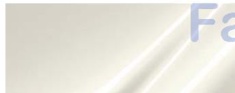
Diamond White 21