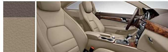
Almond Beige/Mocha (not available with leather upholstery)