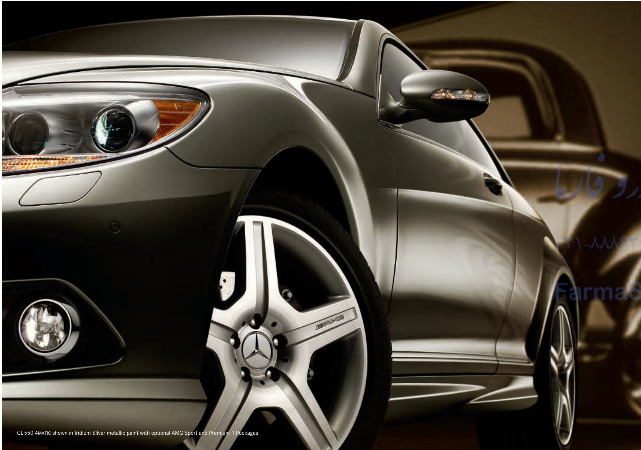
CL550 4MATIC shown in Iridium Silver metallic paint with optional AMG Sport and Premium 1 Packages.