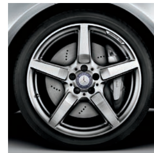
Optional 19" AMG 5-spoke (Wheel Package Plus One)

individually chosen. exquisitely crafted.