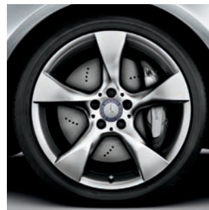
Optional 19" 5-spoke