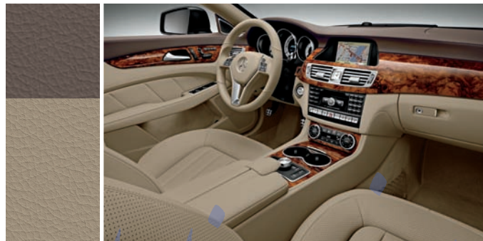
Almond/Mocha (requires Burl Walnut wood trim)