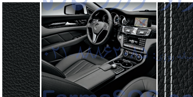
Black (Wheel Packages add contrasting Grey stitching)