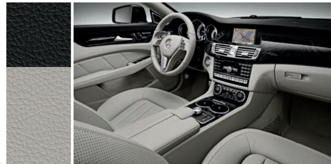
Ash/Black (requires Black Ash wood trim)