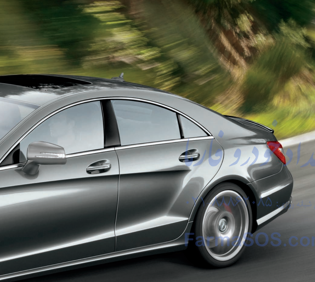
CLS 63 AMG shown with Palladium Silver metallic paint, and optional PARKTRONIC and AMG Performance, Driver Assistance and Premium 1 Packages. Please see endnotes at back of brochure.