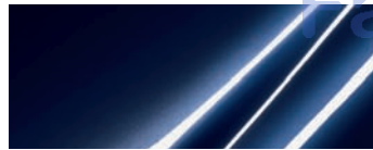
Lunar Blue 23