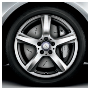
Standard 18" 5-spoke