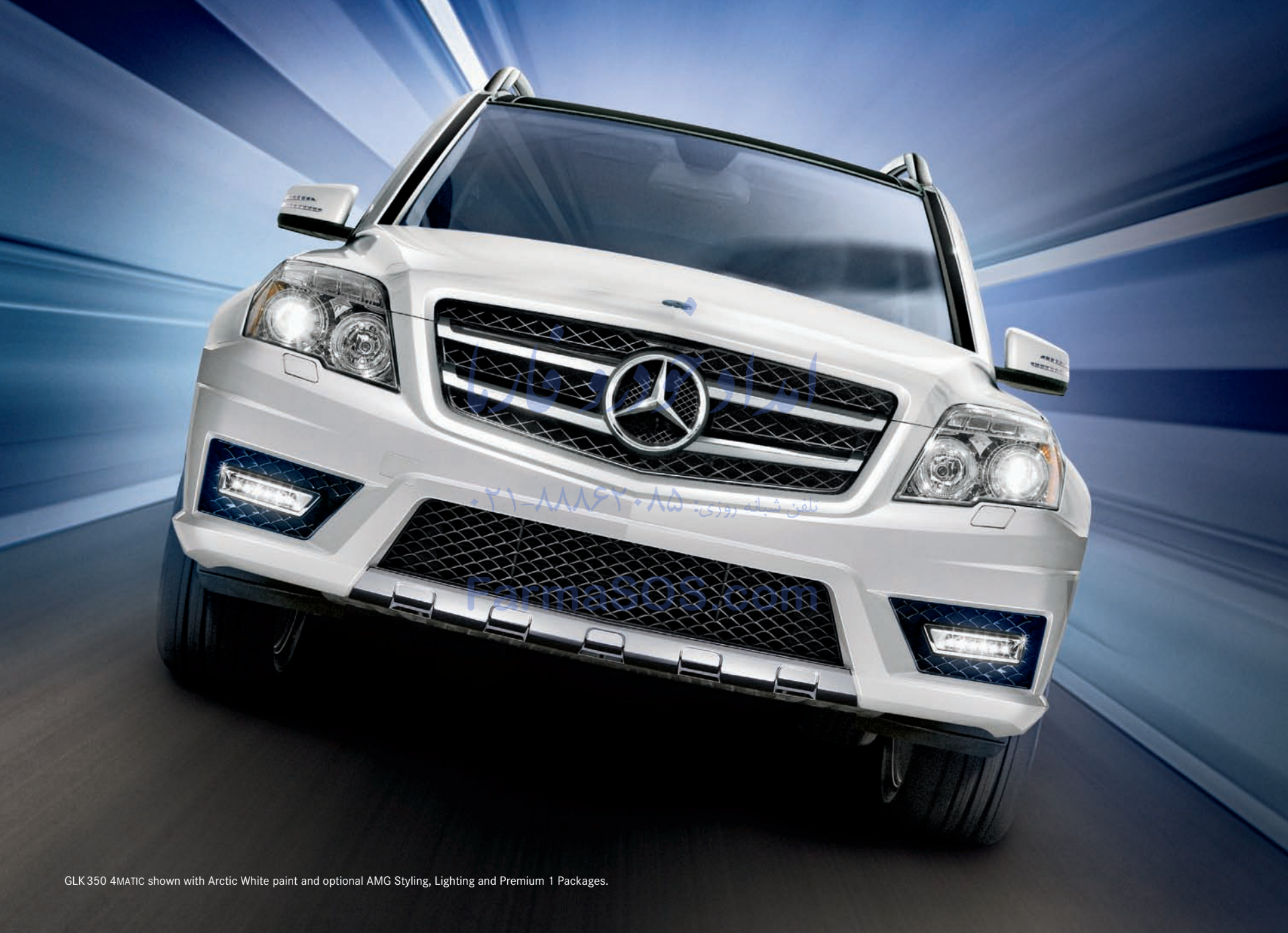
GLK350 4MATIC shown with Arctic White paint and optional AMG Styling, Lighting and Premium 1 Packages.