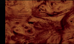
Burl Walnut Wood