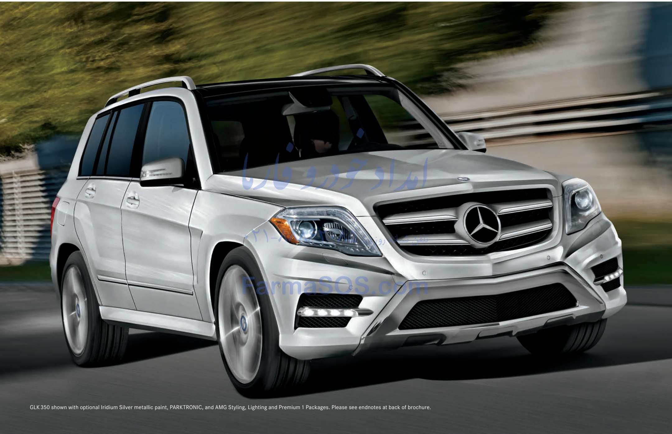
GLK350 shown with optional Iridium Silver metallic paint, PARKTRONIC, and AMG Styling, Lighting and Premium 1 Packages. Please see endnotes at back of brochure.