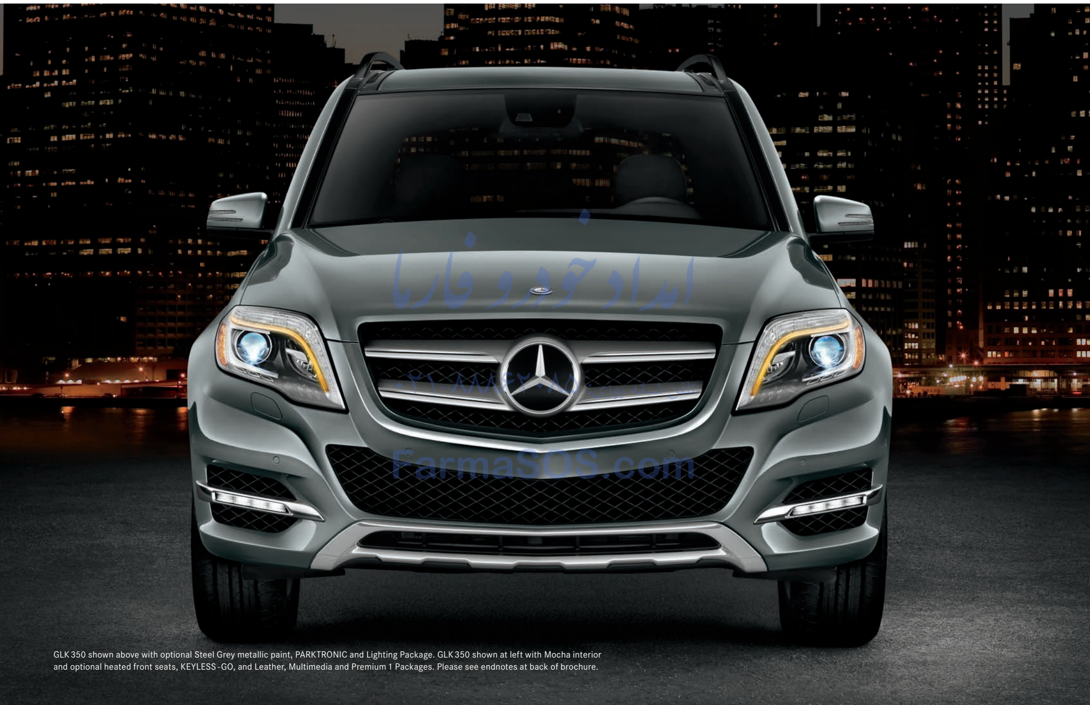
GLK350 shown above with optional Steel Grey metallic paint, PARKTRONIC and Lighting Package. GLK350 shown at left with Mocha interior and optional heated front seats, KEYLESS-GO, and Leather, Multimedia and Premium 1 Packages. Please see endnotes at back of brochure.