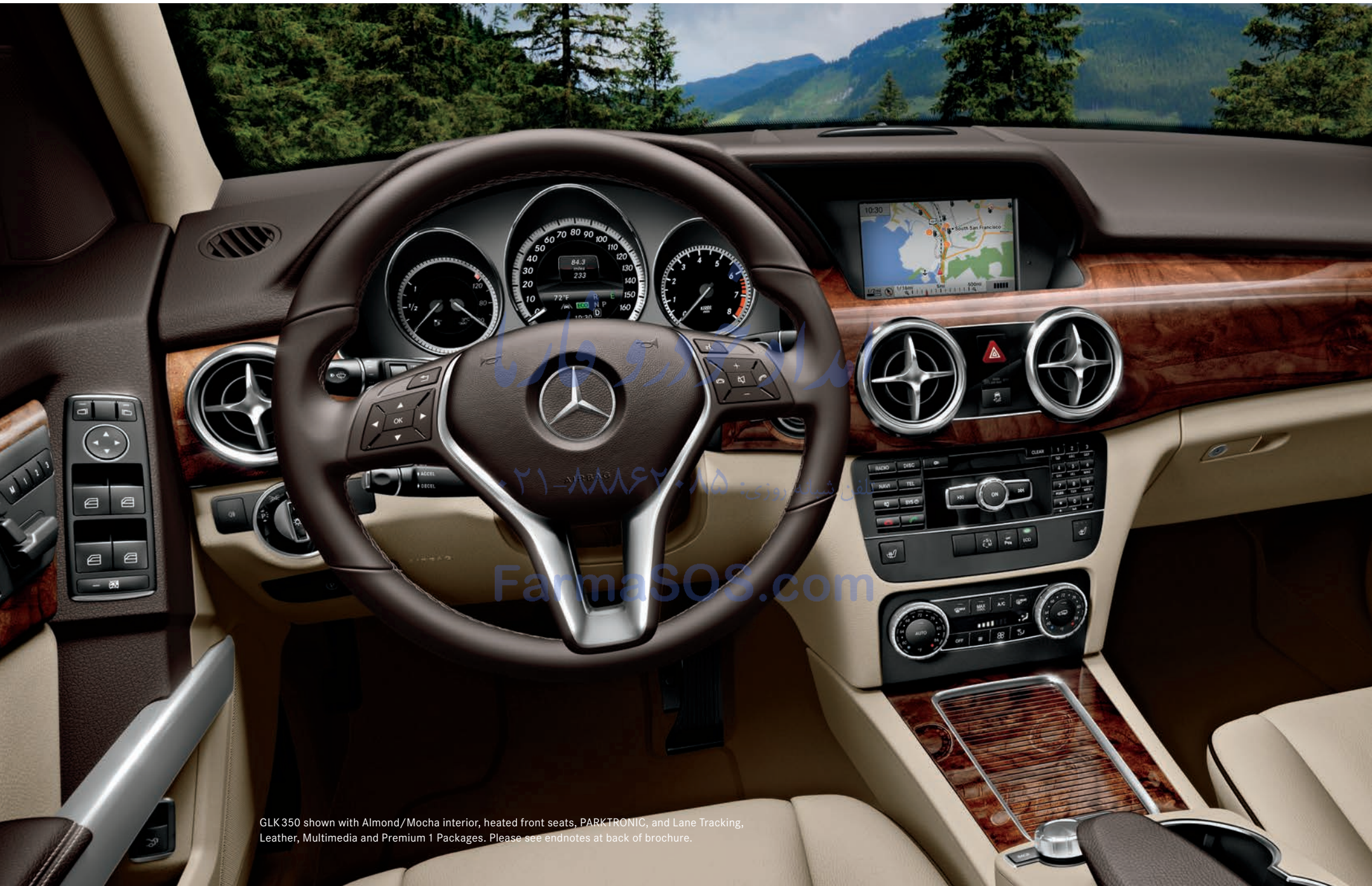
GLK 350 shown with Almond/Mocha interior, heated front seats, PARKTRONIC, and Lane Tracking, Leather, Multimedia and Premium 1 Packages. Please see endnotes at back of brochure.