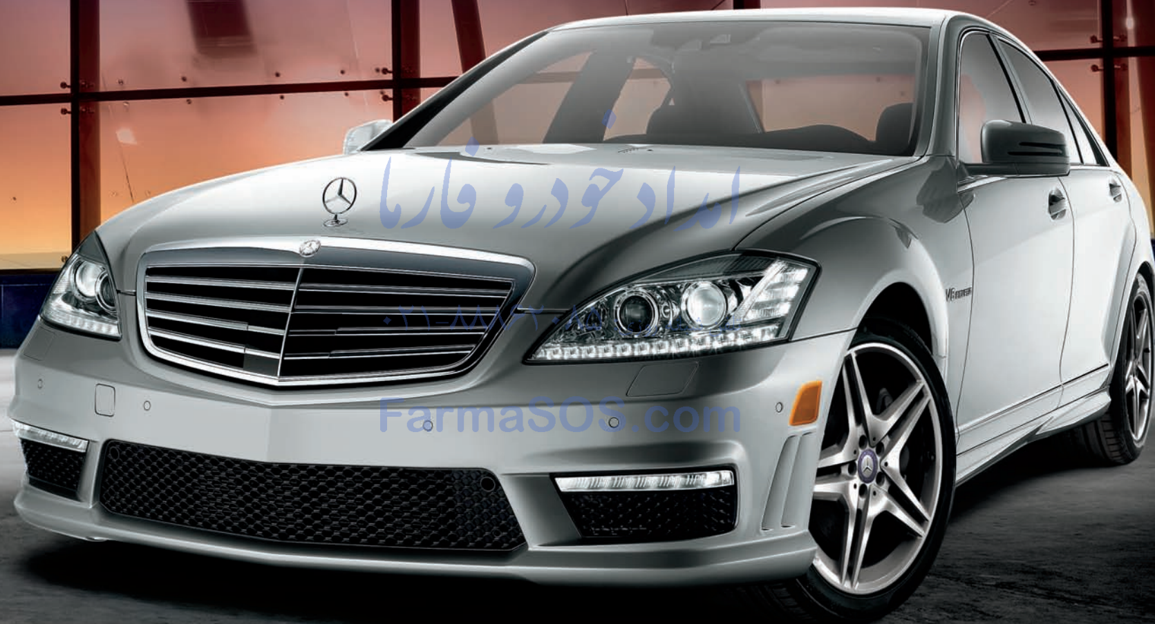
S 63 AMG shown with Iridium Silver metallic paint and optional Driver Assistance Package. Please see endnotes at back of brochure.