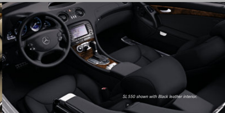
SL 550 shown with Black leather interior.