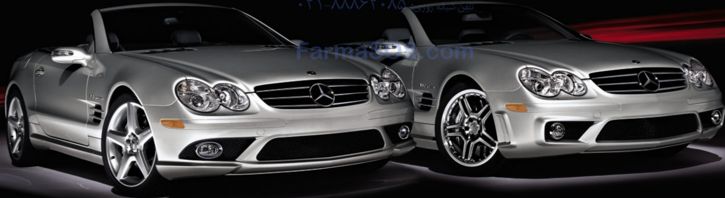
SL 55 AMG shown on left in Iridium Silver metallic paint. SL 65 AMG shown on right in Iridium Silver metallic paint.