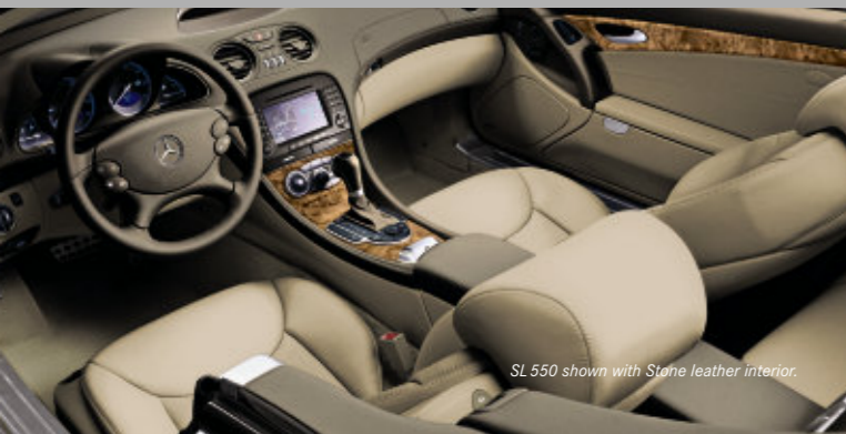
SL 550 shown with Stone leather interior.