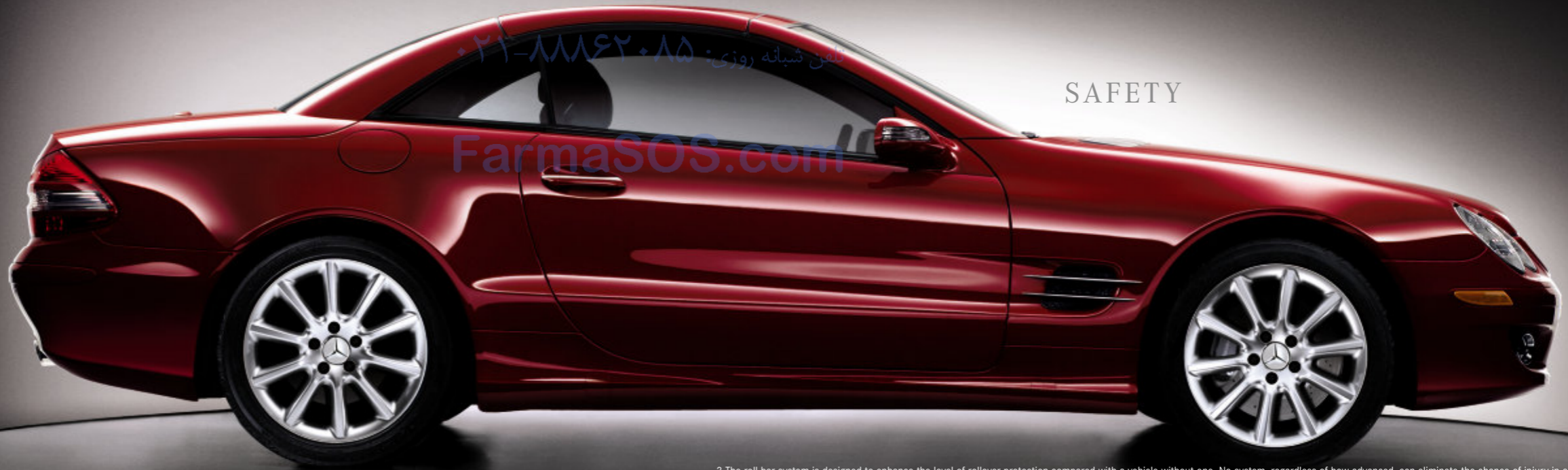
SL550 shown in Mars Red paint.