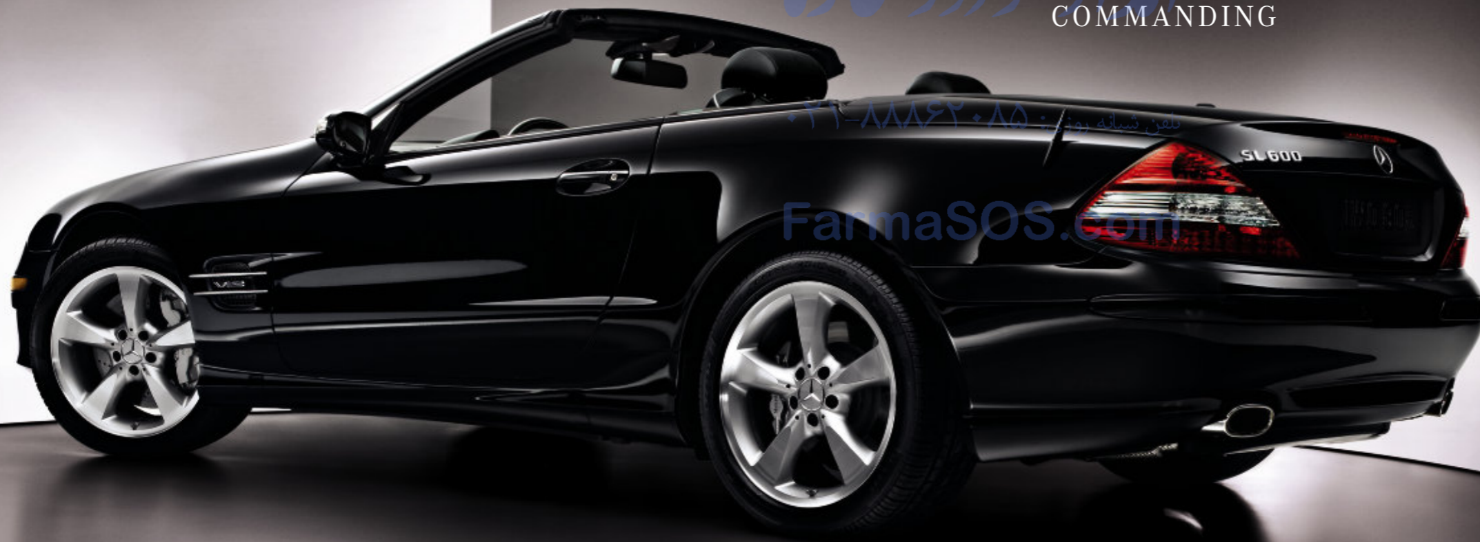
SL 600 shown in Black paint.